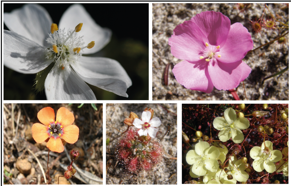
Drosera flowers.