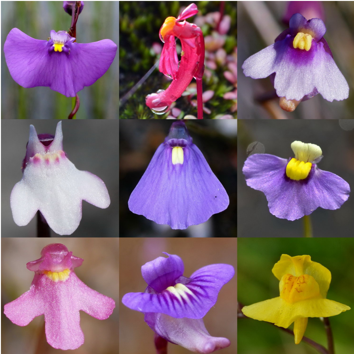
Utricularia flowers – different shapes and colours.