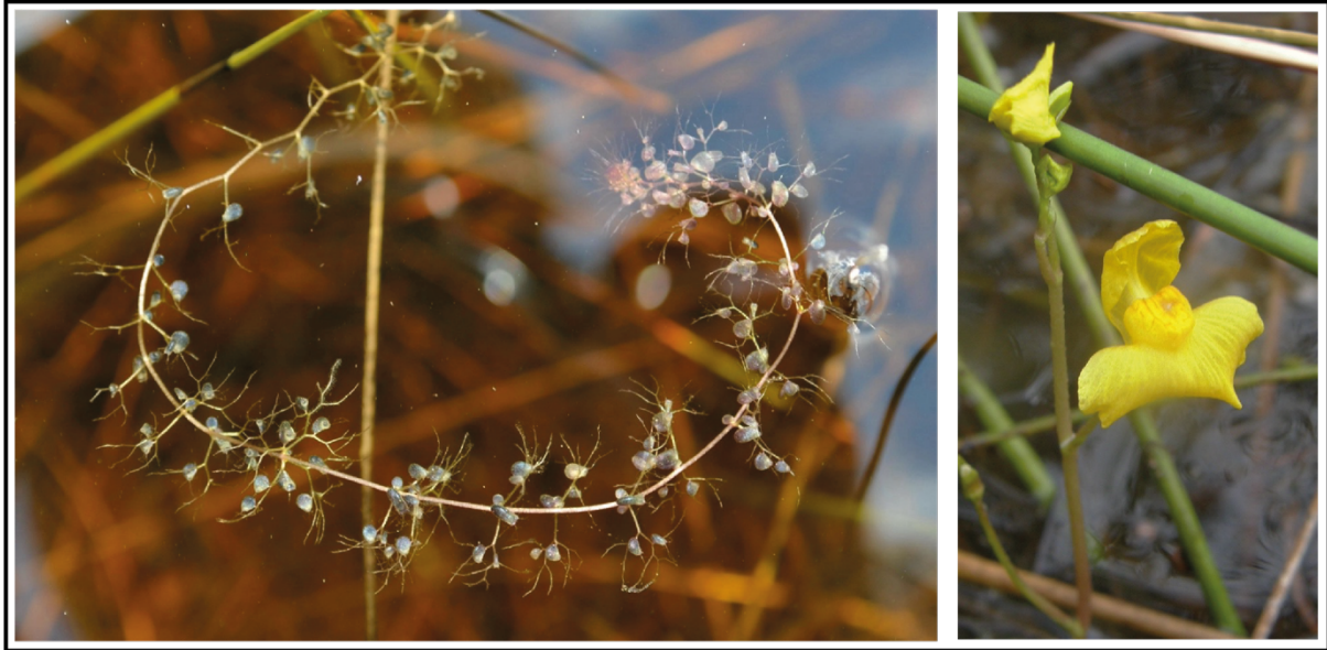
Utricularia australis plant with leaf traps and flower.